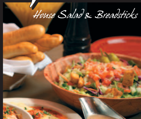
House Salad & Breadsticks