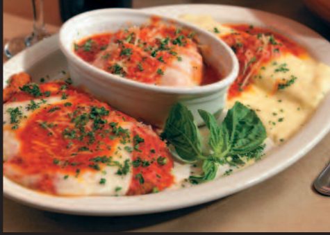
Taste of Italy