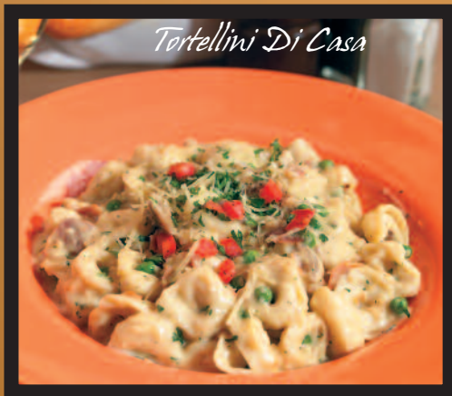
Tortellini Di Casa

Dinner entree prices include unlimited family style salad or house minestrone soup