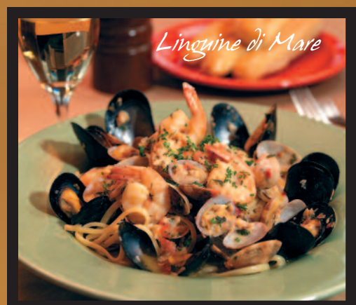
Linguine di Mare

Shrimp, scallops, baby clams and mussels sautéed in olive oil, garlic and diced tomatoes in a tasty white wine sauce. 15.89