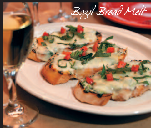
Basil Bread Melt