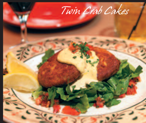
Twin Crab Cakes